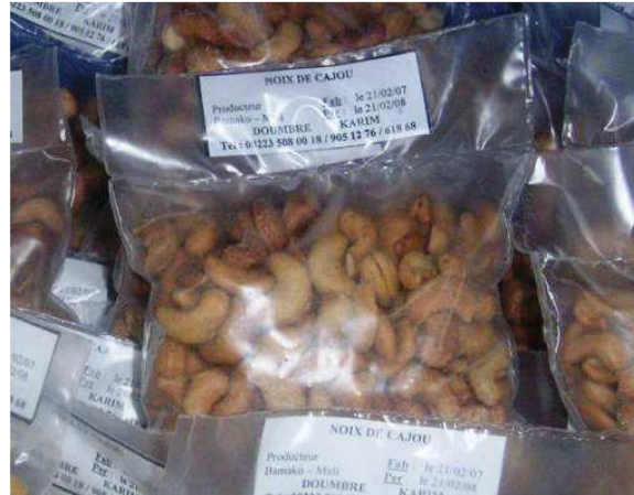
Basic packaging prevails in the Malian market, as evidenced at this stand in Mali's Tonino Market.

This Sahelian country, with a population of 11.9 million and a per capita GDP of $1,200, produces less than 5,000 MT of raw nuts in its southern regions and houses no formal industrial or semi-industrial processors. The few roasters and salters obtain cashew kernels from informal cottage processors or Burkina processors. Cashew products are sold in simple plastic packaging (there is only one brand; most packages are unlabeled) at the cheapest price in the region, an average of $9.96/kg in supermarkets and $12.00 in small shops and boutiques. Although cashews remain a luxury snack, they are much cheaper than imported almonds, mixed nuts, or potato chips. Using this cheaper production for out-of-region exports is not feasible, due to very low capacity and a lack of quality control. For increased volumes in its market, Mali will have to depend on increased local processing capacity or imports from neighboring countries.