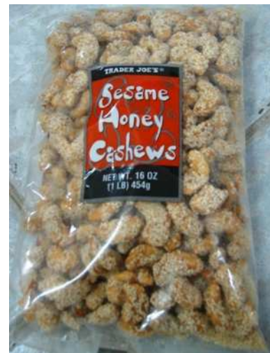
Varied recipes for cashews are offered in the U.S. market. Such opportunity also exists in West Africa.