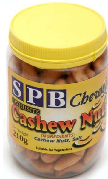
Ghanaian companies offer well-packaged cashews to their consumers.

Ghana offers good quality cashew products, but the products do not reach all potential points of sale and the variety of retail products is limited—only roasted/salted and plain varieties are available. Tourist areas and hotels, particularly outside of Accra, are especially underserved. Few hotels currently use or sell cashews, and volumes are low (with the lowest use in the touristy Kumasi and Cape Coast areas). Cashews are not sold to consumers through mini-bar systems or shops.