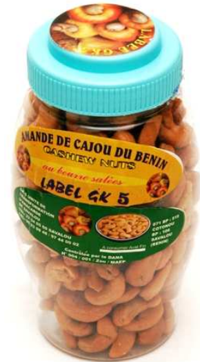
Beninese cashews in attractive containers attract consumers from all social classes.