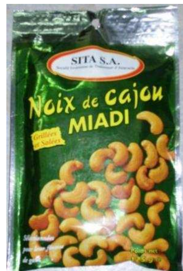
Ivorian cashews packaged in an aluminium sachet

The majority of small roadside shops source their cashews from Burkina, and they have little variety in product and plain packaging (unlabeled plastic sachets) but prices are 40% cheaper than in the supermarkets. In supermarkets and gas stations, many distribution channels exist and quality and packaging are good, but prices and lack of promotion limit sales growth, volumes are low, few flavors are available, and there are no secondary products on the market. Luxury hotels and restaurants in Abidjan use cashews for cooking and baking or as an appetizer. Hotels are interested in cashews packaged under their own label. Service stations are the highest volume distribution channel in Abidjan,