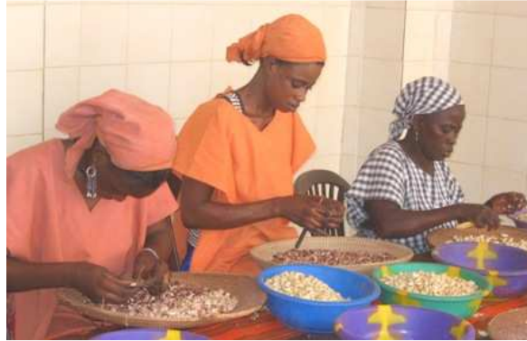
Semi- industrial cashew processing at ACASEN in Senegal

Five countries in West Africa now boast industrial capacity cashew processors that target the export market. These factories—most of them established in recent years—use modern, Indian semi-mechanical technology to produce 1,000–15,000 MT of raw nuts per year. Though export-oriented, they sometimes sell kernels to local roasters and semi-industrial plants—particularly the broken grades, which can be difficult to commercialize on the export market. Industrial processors are found in Benin, Burkina Faso, Côte d'Ivoire, Guinea-Bissau, and Nigeria.