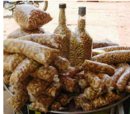
Cashews for sale at a roadside stand in Burkina Faso

Cashews—as a snack or cashew butter—are widely distributed in supermarkets and small shops in Ouagadougou and Bobo Dioulasso. The cashew retail price is $9.80/kg in supermarkets. Sales are highly seasonal, peaking in October–December (holiday period) and January–May (cashew nut season). Supermarkets buy directly from the industrial processor or through wholesalers who buy from small local processors, but they face irregular deliveries and occasionally run out of stock. Overall, volumes of sales are low, there is little variety in flavor, and simple plastic sachets without labels or brands dominate the market. The quality of the cashews is perceived as low, probably also due to the poor packaging.