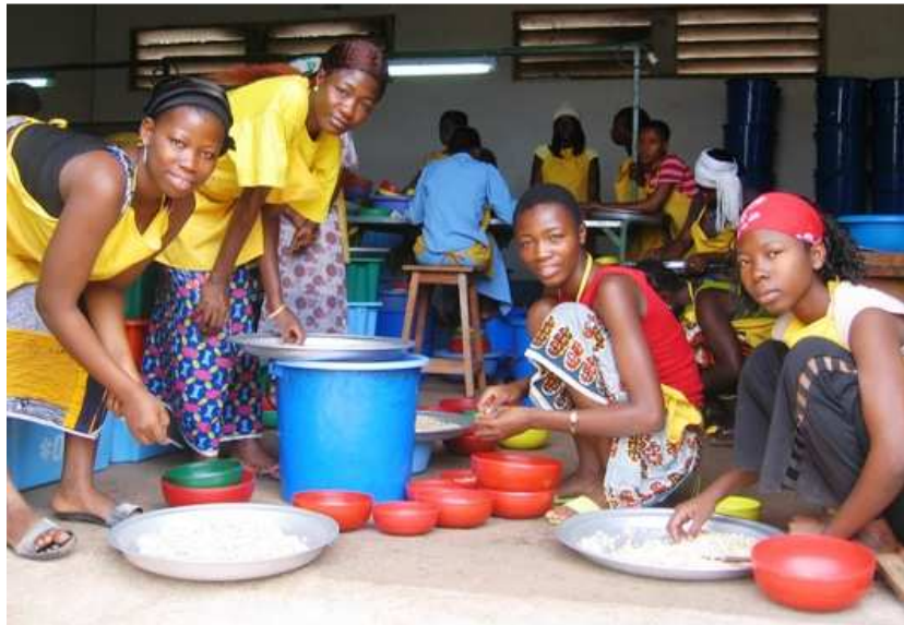
The cashew processing industry is creating jobs in West Africa, as in this factory in Côte d'Ivoire. This retail market study aims to help the processing industry, from cottage to industrial-level processors, grow by expanding consumption in the region.

West Africa's position as a raw nut exporter may change in the near future, as processing capacity is growing rapidly. International nut trading companies Olam and Global Trading built three new export-oriented processing factories in Benin, Côte d'Ivoire, and Nigeria in the past 2 years, and further expansions are under consideration. At the same time, at least three local businesses have set up facilities in Burkina Faso and Nigeria targeting the export market. Developing the local market for cashew sales will also help processors trying to export by providing a consumer source for less common grades of cashews and a regular source of income.