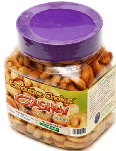
Improved packaging, as shown with this Nigerian product, appeals to consumers.