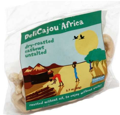
This Senegalese processor uses packaging with an African theme to attract consumers' attention.

Plain, roasted and salted nuts are the most frequently purchased and preferred types of cashews. Participants in the group interview indicated that they would buy broken kernels if they were cheaper. People eat cashews mainly at home, but also while they travel, making distributions at service stations and airports a good option to increase sales. Most people did not know that cashews are grown in Africa, and the majority indicated that they would purchase more if they could buy 'African labeled cashews'. Quality of cashews is inconsistent: Cashews sold on the street sometimes contain sand but cashews sold by established roasters and salters are good quality. Packaging materials can be improved. Plastic cartons popular in Senegal are fragile and may not hold up in transport.