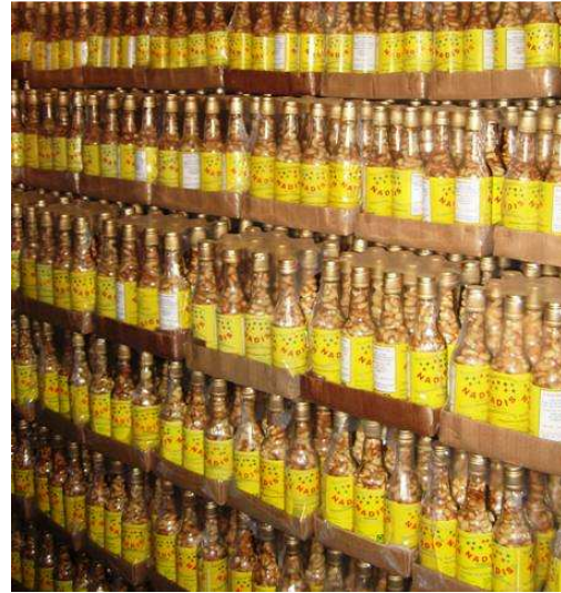
Rows of cashews line the walls of a processor in Nigeria. Nigeria's huge population offers excellent potential for increased consumption.

Regional economic giant Nigeria, with a population of 135 million and a per capita GDP of $1,400, has a relatively young, but large, cashew sector and the largest potential market for cashew products in the region. The country produces approximately 80,000 MT of raw nuts, of which 50,000 MT are exported. At least six industrial-sized factories and four semi-industrial facilities form the region's largest processing industry (with 23,600 MT installed annual capacity and 2006 production of approximately 16,000 MT). Factories are owned both by an international company and local entrepreneurs. Two industrial-sized factories recently started operations, in which most installed capacity is intended for exports. Currently, Benin is exporting small quantities of retail and bulk cashew kernels to Nigeria; this is likely linked to shortages of supply in Nigeria and may be short-lived, as Nigerian cashew processors sell cheaper products than many coastal countries in West Africa. At present, the Nigerian domestic market for cashews is considerably more interesting than the regional market for domestic processors due to its size, familiarity, and potential for growth.