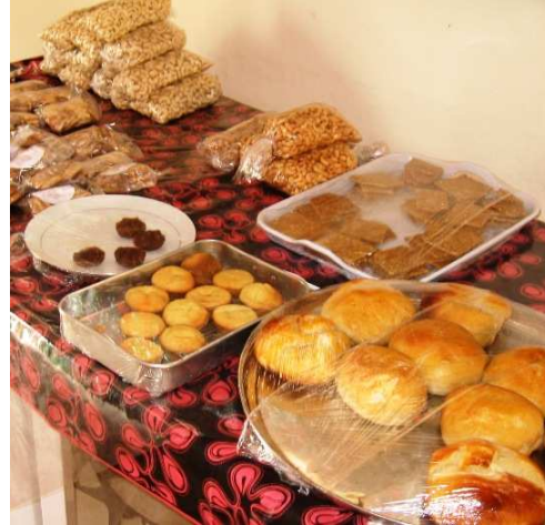
Though whole roasted cashews dominate the regional market in West Africa, there is great potential for cashew use in other products such as the cookies, toffee, and rolls offered at this shop in Guinea-Bissau.