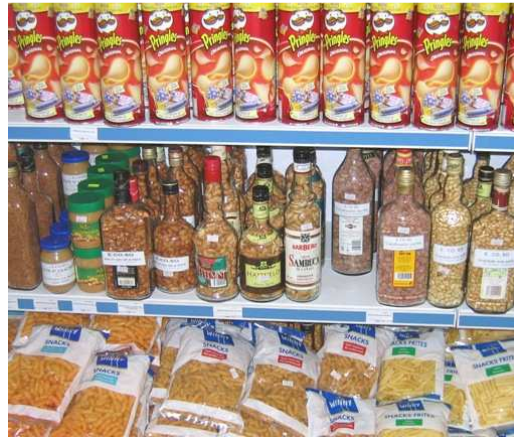
Cashews must be promoted in order to compete in Togo's snack market.

Most supermarkets sell cashews in Lomé, but volumes are low and 40% of supermarket managers are dissatisfied with the quality of the distributed cashews. Market stands and shops also sell cashews in small amounts at prices that are 50% cheaper than in supermarkets. There are several large (150+ room) hotels in Lomé, but none use significant quantities of cashews: Only small amounts are used in cooking.