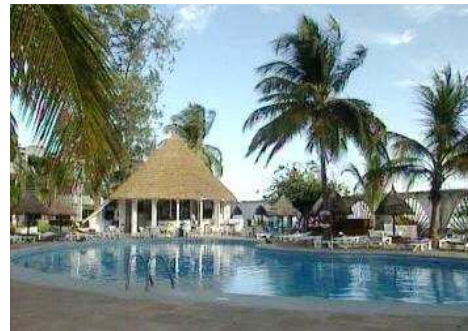
The Gambia has excellent potential for expanding cashew marketing and consumption in its many hotels.

Cashews are widely distributed in The Gambia and are sold in color-printed sachets (150 g) or tins (100 g) for an average price of $26.40/kg in supermarkets. Cashews sell well, however, 75% of supermarkets import their cashews from Europe or Senegal and 50% of supermarkets sell cashews imported from Europe only. Supermarkets indicate that packaging and quality of locally produced cashews must be seriously improved to replace the imported cashews. Cashews sold in market stands originate from local processors and are 20% cheaper than cashews in supermarkets, and volumes sold are higher. However, quality varies widely and few products are sold under a recognized brand, reducing consumer perceptions of quality.