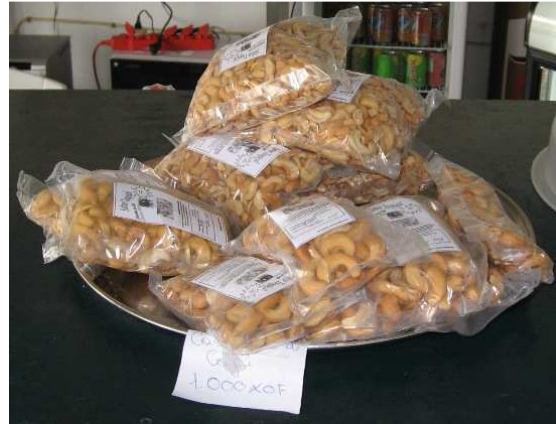
A major producer of cashews, Guinea-Bissau is one of few countries in the region offering retail sales of cashews in airports, as pictured here.

Guinea-Bissau is very competitive as a supplier of bulk white kernels to roasters in Senegal and The Gambia. However, because it is the only Portuguese-speaking country in the region and it has a challenging road and transport network (including the port), exporters must overcome numerous constraints to trade in Guinea-Bissau.